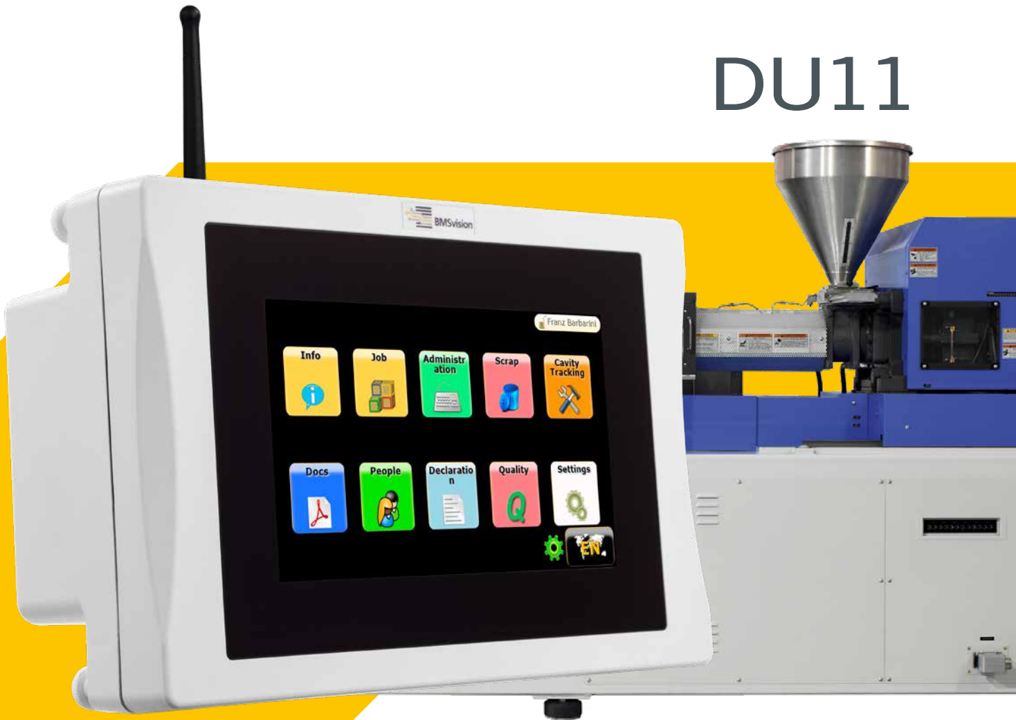
7" touch screen Data Unit