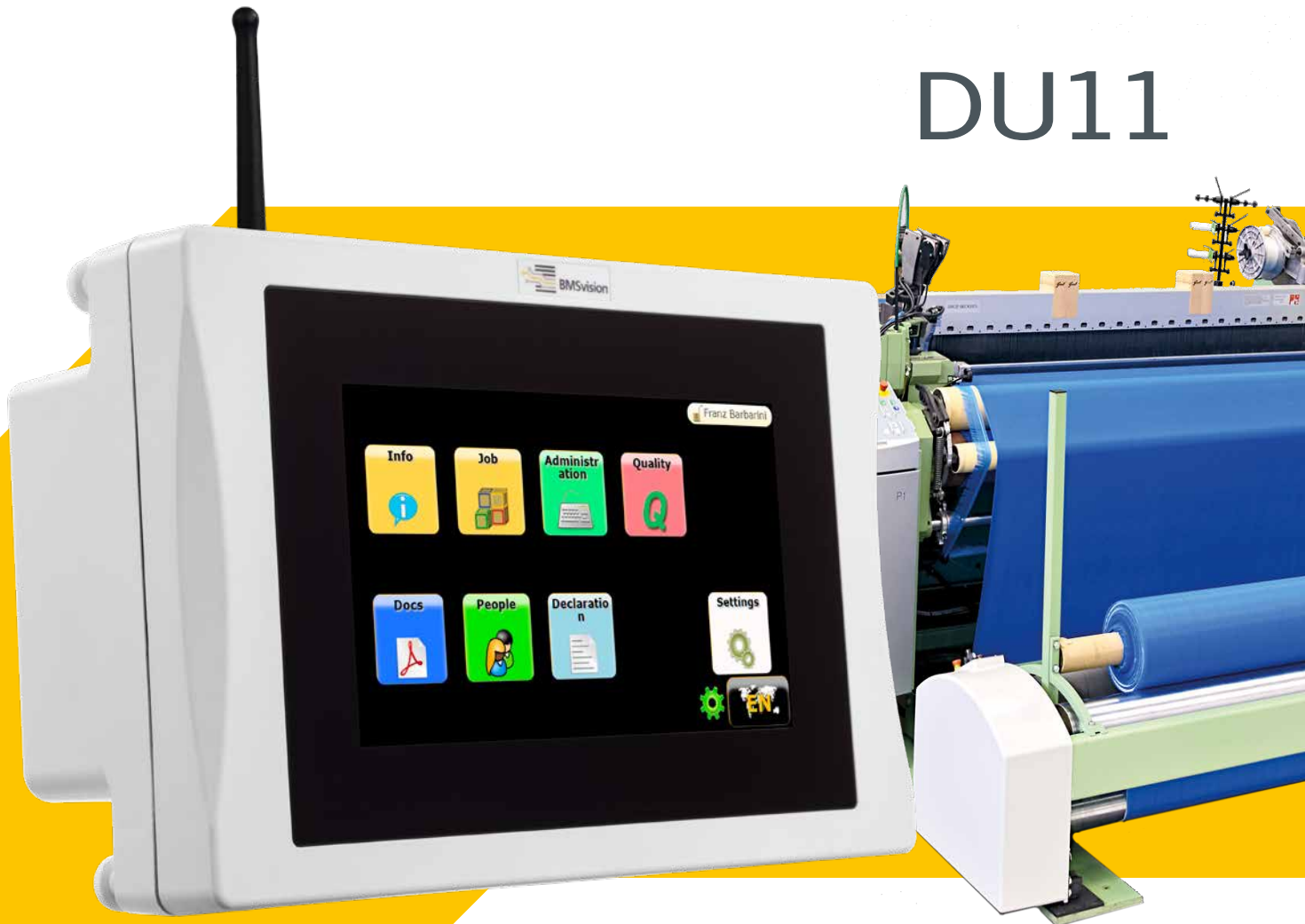
7" touch screen Data Unit